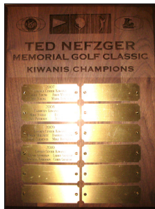
Kiwanis Traveling Trophy

Clubs with four or more players will receive Interclub Credit